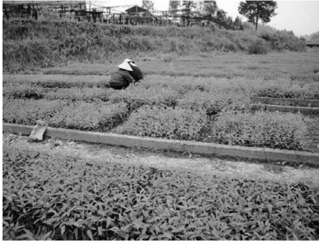
Fig. 3. Eucalyptus urophylla seeds in the Forest Research Center.

Taiwanese investors in forest plantations in Vietnam and Cambodia (50,000-60,000 Acacia mangium seeds annually). The cost of seedlings is 700 VND/seed for E. urophylla , and the price for Acacia mangium is 600 VND/seed. Individual farmers order between 2,000-3,000 seeds, and households for the cooperative sector purchase between 15,000-25,000 seeds. Companies purchase on average between 200,000-500,000 seeds each year.