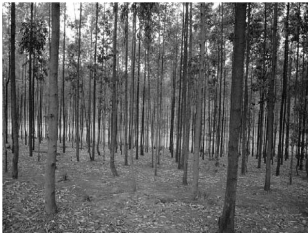
Fig. 5. Eucalyptus europphylla planted by households in the formation of a cooperative in Tu Da Village, Phu Ninh District.

Vinapaco has been working with 32 cooperatives under a contract farming scheme in many districts. In one example of this, fourteen households in Phu Ninh District in Phu Tho Province have established a cooperative with a total area of 34.3 hectares and called Commute Tu Da. The initial planting of Eucalyptus europphylla started in 2005. Ten Lem, the female head of the cooperative, owns approximately 2-4 hectares of this land. The land was originally owned by a community group in the village and was infertile and very difficult for growing vegetables and cassava. The community group then shifted to growing trees by planting Eucalyptus europphylla (Fig. 5). In the eight years it took for these trees to grow to harvestable size (2013), farmers planted vegetables and rice on their other more fertile land, and maintained livestock such as cows and pigs, and fish in the river.