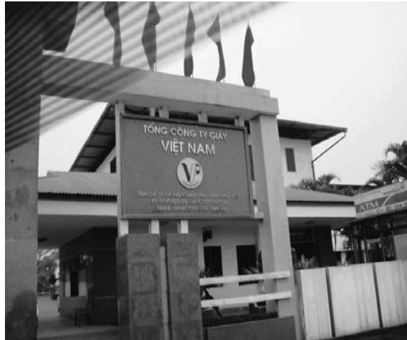
Fig. 2. Profile of Vinapaco Company in Phu Ninh District.

According to an officer of Vinapaco, there are some constraints to the development of the company: