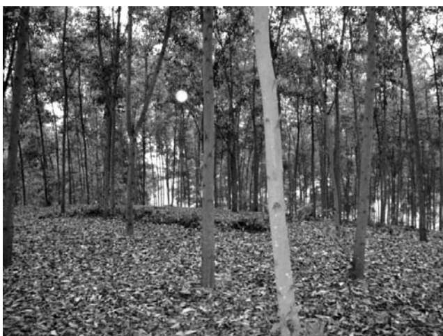
Fig. 6. Acacia hybrid planted in critical land belong to independent farmer.