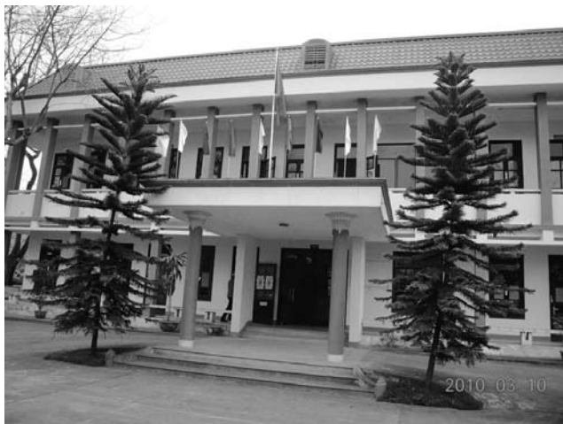
Fig. 4. The Forest Research Center Office in Phu Ninh District, Phu Tho Province.

The constraints faced by the Forest Research Center (FRC) (Fig. 4) are as follows: (1) a lack of budget for new technology development research. So far, the annual budget of about 15 billion VND is insufficient; (2) the attainment of intellectual property rights for new tree species findings, which creates difficulties in the self funding of activities through the sale of products in the market; and (3) an inability to expand international cooperation to improve seed quality (Ibid).